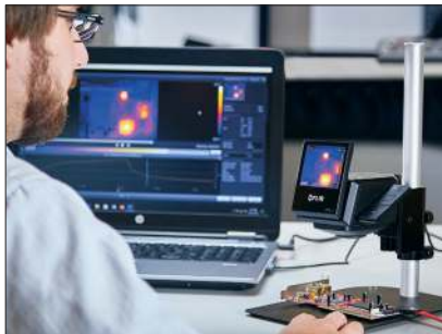
Connect over USB a computer to analyze data in FLIR Tools+