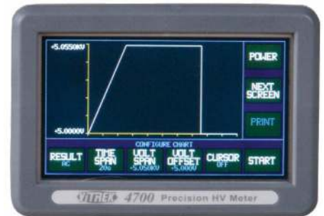
Chart Mode automatically plots voltage readings from a few seconds to several days. Highly useful for determining ramp linearity, overshoot and sag on hipot testers and other HV sources.

Automate your HV test requirement with the 4700's built-in Ethernet port, high speed serial communication port or available GPIB. The 4700 is fully programmable—so you can select your measurement mode and bandwidth, then take readings as often as desired. The 4700 also comes standard with a USB printer port, to capture readings and get hardcopy printouts of HV plots—so you can document the sag or overshoot in a typical hipot test.