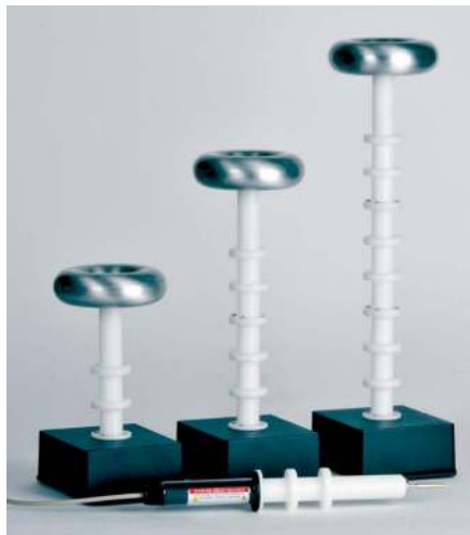
HVL Series High Performance Lab Grade, HV-SmartProbes™ shown above in 35KV, 70KV and 100KV models. Handheld HVP-35 portable HV-SmartProbes™ shown with detachable probe tip.

However, should you care to expand your high voltage measurement range—just add one or more of the available 35KV, 70KV, 100KV and 150KV SmartProbes™. The Vitrek SmartProbes™ each store their own calibration data which is down loaded when they are plugged in to the 4700—this results in high accuracy, calibrated readings and allows any Vitrek SmartProbe™ to be used with any 4700 HV Meter. The SmartProbe's™ proprietary, ultra-low TC attenuator design minimizes self-heating—while its low capacitance technology enhances AC